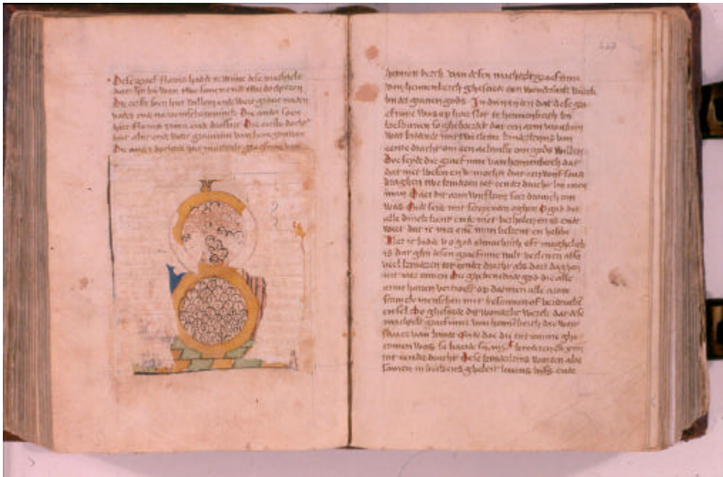
(Boven: Machteld van Hennenberch) – (Onder: Gijsbrecht van Brederode)