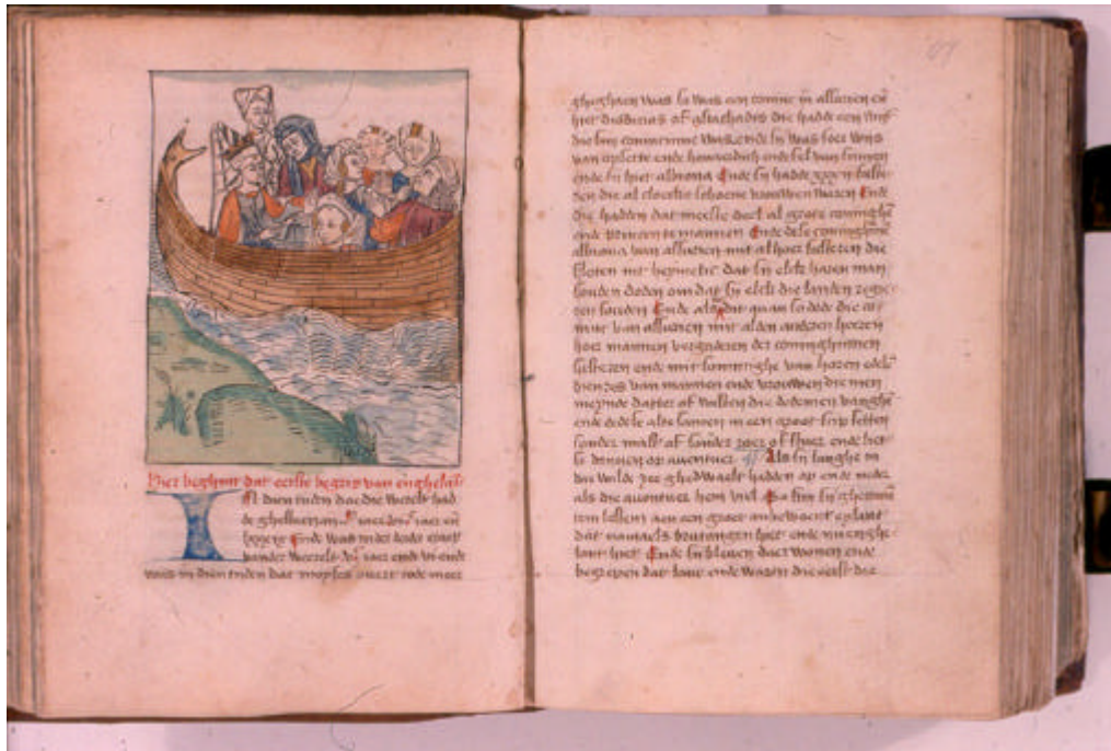
(Boven: Begin Engeland) – (Onder: Bonifacius)